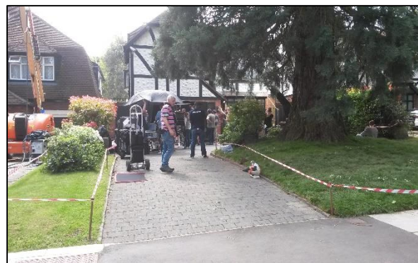
Filming in Canons Drive for a new advert on behalf of Amazon Prime, to be released soon.

Projects planned for 2016 include improving the amenities of the Seven Acre Lake by installing a new bridge across the inlet stream to ensure that the area is more easily accessible to wheelchairs and children's pushchairs. It should also improve safety. A full Health and Safety inspection of the Lake is also planned.